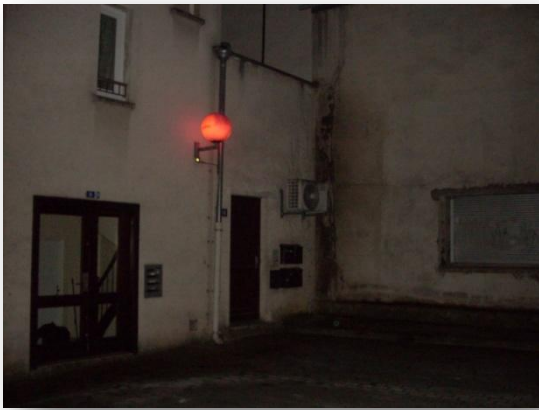
The back street of a shop.