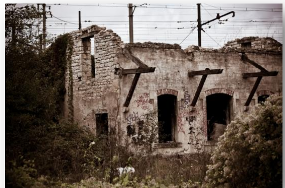
An old house that homeless people use as a shelter.