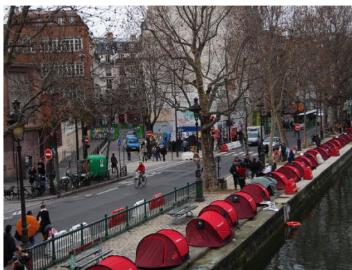
Paris : The Homeless living on the bank of the river

Seine in the centre of Paris. The tents are given by activists of the association Don Quichotte. They often organize protest demonstrations in order to force the government into building affordable social housing. Housing in Paris has become too expensive.