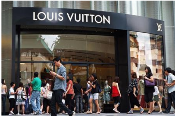
Paris – Champs-Élysées...