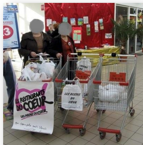
Collecting of food at a local supermarket for the Restos du Coeur.