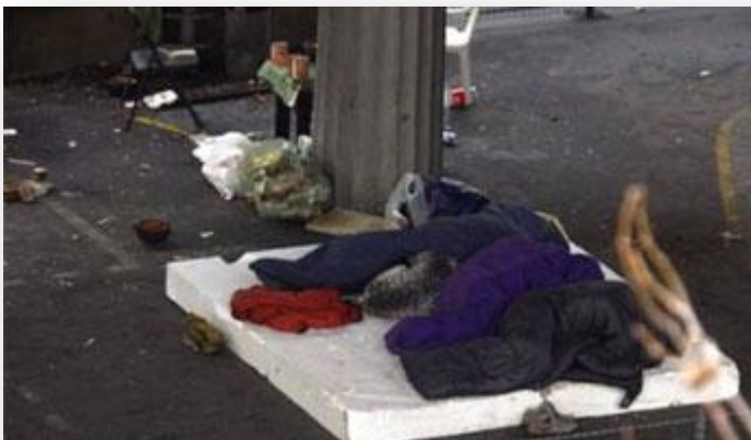
A homeless living under a bridge